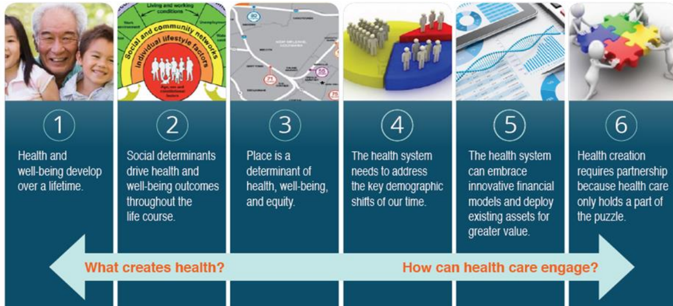
Figure 1: Foundational Concepts